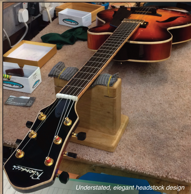
Understated, elegant headstock design