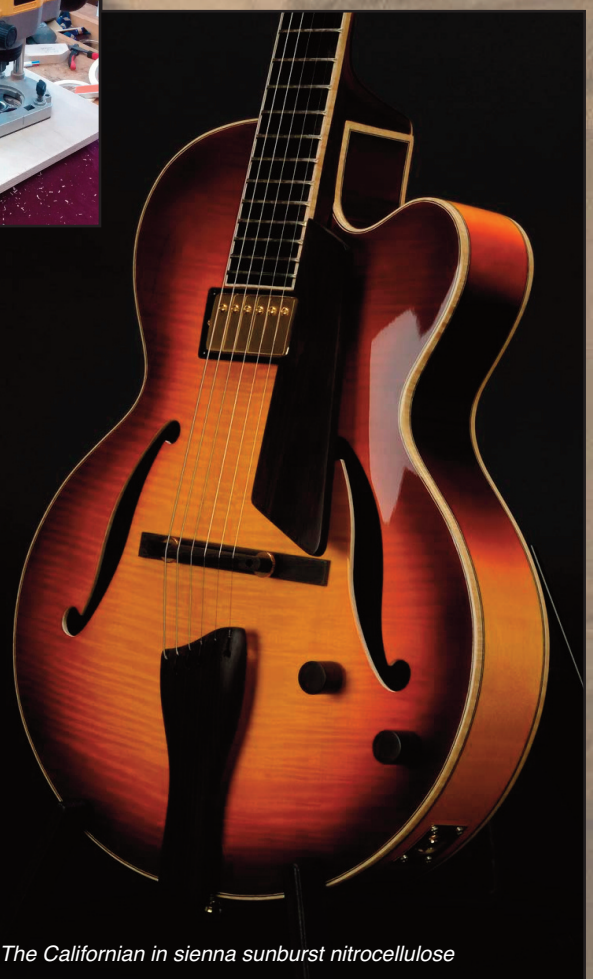
The Californian in sienna sunburst nitrocellulose

Body Style Arched back and top, Venetian Cut-away - Body Width at Lower Bout: 375mm - Body Length: 490mm - Body Depth: 62mm - Top Wood: Carved AAA American Flame Maple - Back & Sides: 3-ply Laminated Maple - Binding: Solid Maple - Nut: Bone - Neck Profile: 43mm at Nut, 57mm at End Fret - Neck Construction: American Maple - Finger Board: Indian Ebony Fingerboard - Neck Scaling: 625mm - Frets: 22 - Bridge: Indian Ebony Floating - Finger Rest: Indian Ebony Floating - Tailpiece: Indian Ebony Floating - Tuners: Gotoh SGS510Z - Pickups: Kent Armstrong 'Six Shooter' Humbucker - Pots: Premium CTS 500K/ Bournes Push/Pull Audio Sweep Tone/ Volume - Output Jack: Switchcraft - Finish: Sienna Sunburst Nitrocellulose - Strings: Flats - Case: Hiscox Insulated Flight Case. All our guitars can be custom finished to your requirements. More information at www.fibonacciguitars.com .