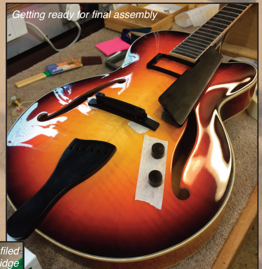
Getting ready for final assembly

The Californian boasts a premium, hand carved, seasoned, 35mm AAA select American flame maple sound-board, facilitating a substantial arched top complimented with 3-ply laminated maple back & sides. Trimmed with single ply, solid maple binding throughout, the neck construction consists of flame maple with an ebony fingerboard. The bridge, finger-rest & tail-piece are all hand crafted in solid Indian ebony. Each floating bridge is individually custom fitted to the hand carved arched top, thus ensuring the transmission from each string ringing true.